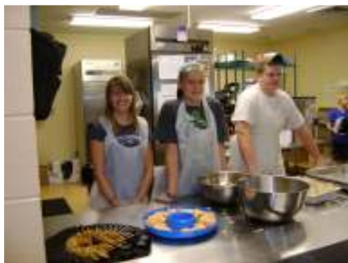
Kerr Memorial serving lunch at the Hospitality House to approximately 70 people.

Groups from Gibson, Concord, Mt. Holly and Kingdom Builders served in July and a group from Greensboro will be serving the first week of August.